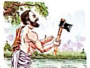
to cut the wood